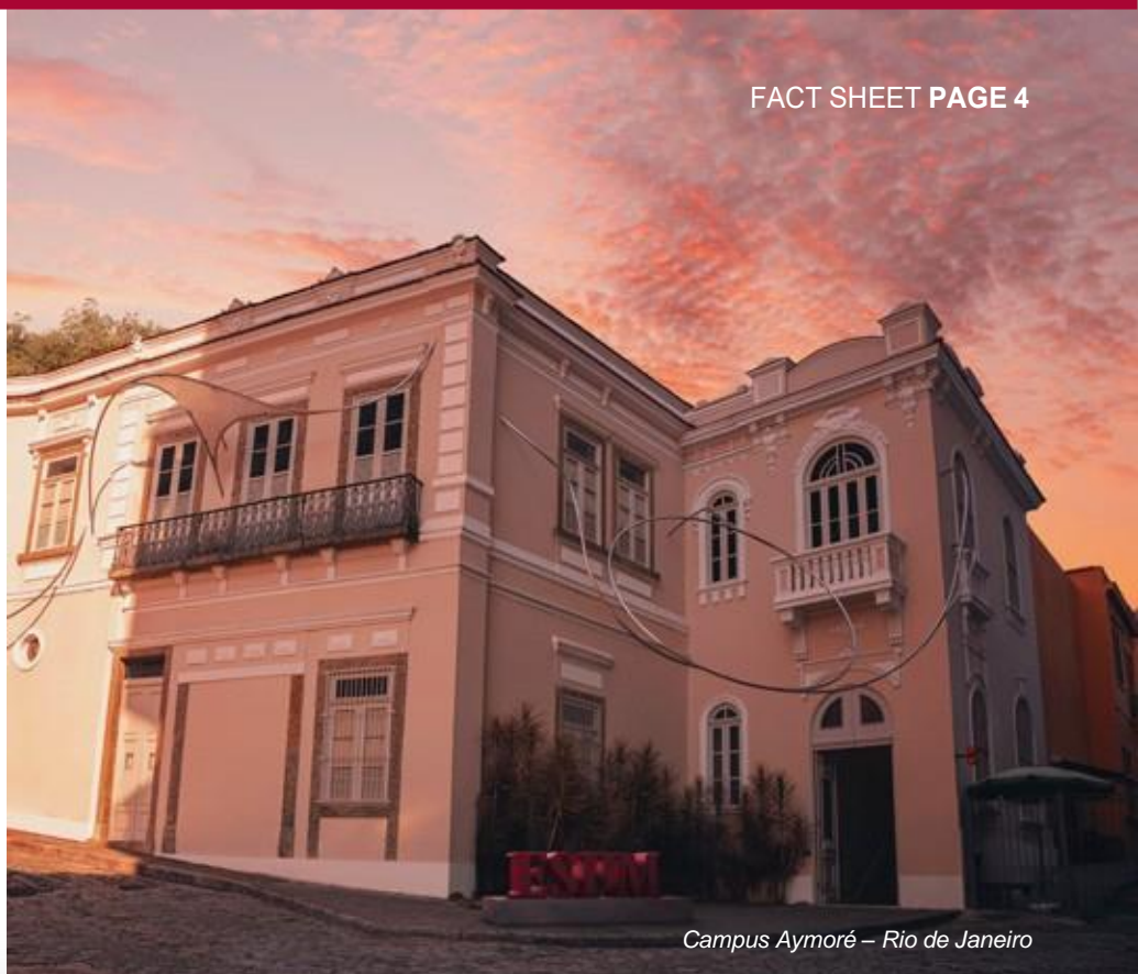
Campus Aymoré – Rio de Janeiro